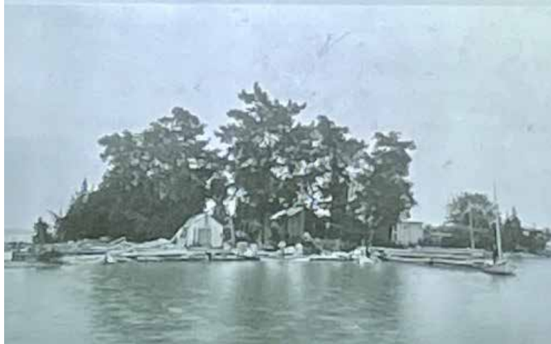
Bassett Island in the Nineteenth Century