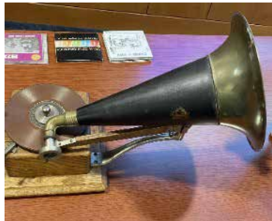
Berliner Gram-o-phone(1903), a Victor Monarch (1903) and an Edison Triumph -- a 1909 version of an 1898 machine