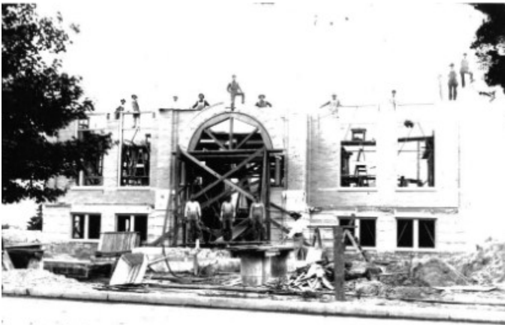
The Carnegie Library construction started in 1904.

They told the story of the development of libraries in the Grand Traverse area begins with the very early Traverse Township Library and the 1869 formation of the Ladies Library Association. Eventually the Carnegie Library on 6th Street was built to house a growing public library.